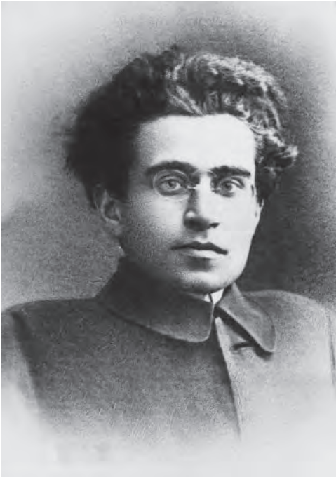
▲ Antonio Gramsci, 1891–1937, wrote widely on philosophy, politics and linguistics; he was also a founding member of the Communist Party of Italy