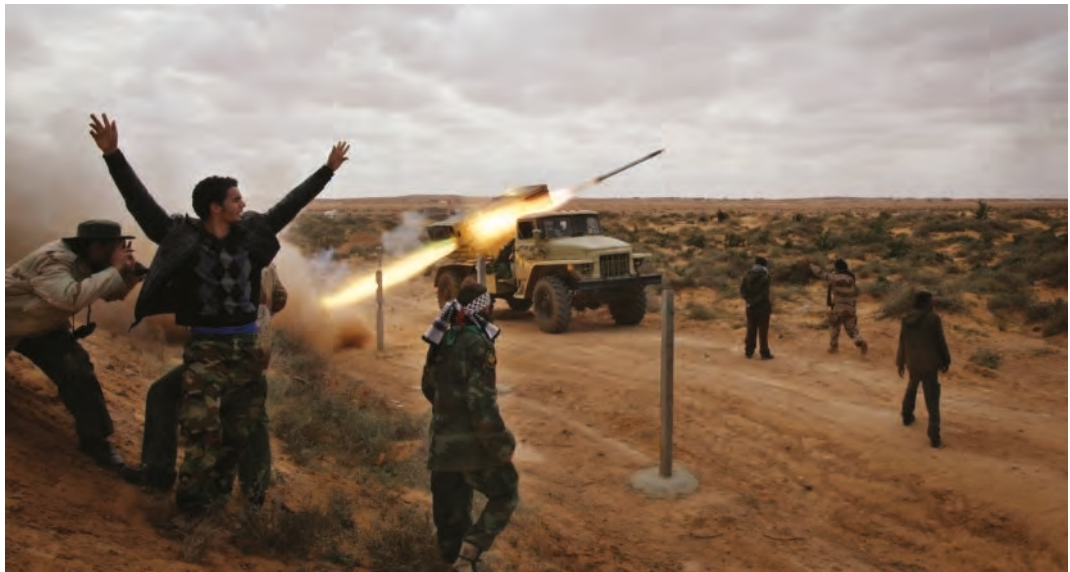
▲ 9 March 2011: Rebel soldiers fighting against Colonel Muammar Gaddafi fire a Katyusha rocket near Ras Lanuf, Libya

Many claim that the term “states” has become outdated as boundaries are no longer legitimate, and the sovereignty of states has been questioned by trade agreements and large multi-national corporations. Also, the porous nature of many states with the immigration and migration of millions of people around the globe questions the stability of territory as it has been traditionally defined.