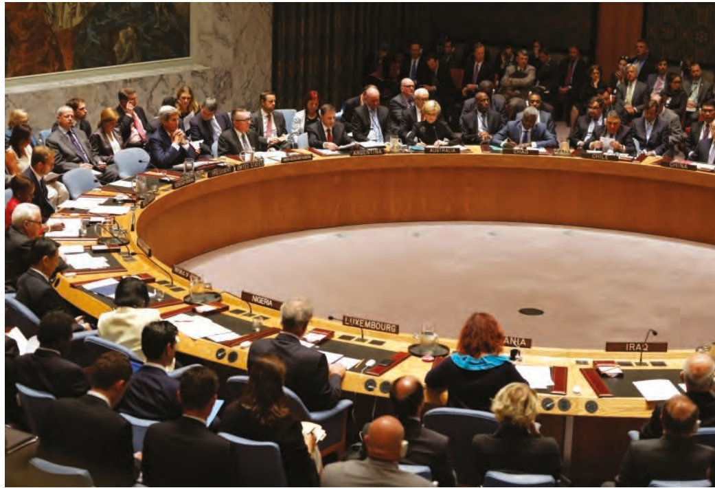
▲ The Security Council chamber at the UN headquarters in New York

Many, then, bring into question the place of the United Nations in world politics and as an example of good global governance. The next unit on human rights discusses these issues in more detail as Franklin D. Roosevelt's wife, Eleanor, initiated and founded the commission that drew up the Universal Declaration of Human Rights. The debates around this declaration and the inability to enforce human right precepts are ongoing problems that attract attention from every part of the globe. Importantly, the United Nations operates by assembling nations together, while the daily realities of local and global politics takes place on levels far below the chambers of the United Nations in New York.