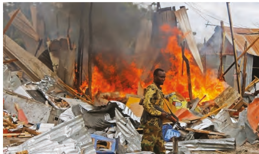
▲ A Somali National Government soldier walks past burning debris following a suspected suicide bombing

Can a person or group of people know what is best for other people?