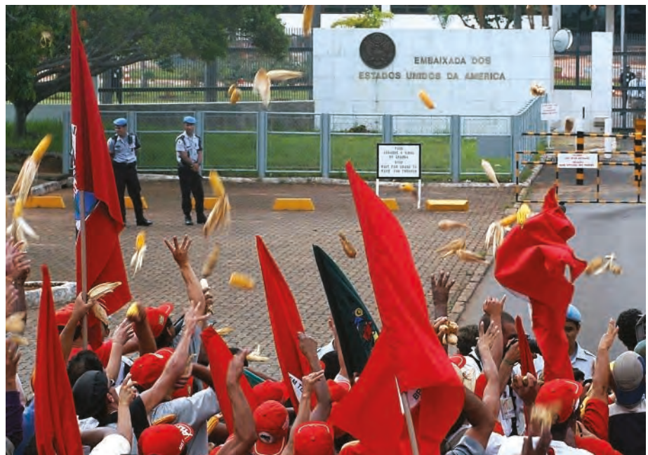
▲ Members of the Landless Workers’ Movement throw corn towards the gates of the US embassy in Brazil, in protest against the Free Trade Area of the Americas (FTAA) and the World Trade Organization (WTO)