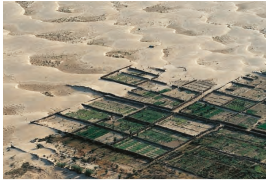
▲ Desertification necessitates permanent crop protection in many parts of the world

So how did we get to this point of ever more complex forms of social hierarchy, power, and authority? What is the difference that people experience in a simple or a complex society? We have seen in the introduction chapter that earlier societies are not just societies and cultures minus some of the characteristics of more modern ones. They are qualitatively different from the societies and culture that most of us live in today, and our experience of daily life is, by definition, very different from those who lived hundreds or thousands of years ago. We are unique, indeed.