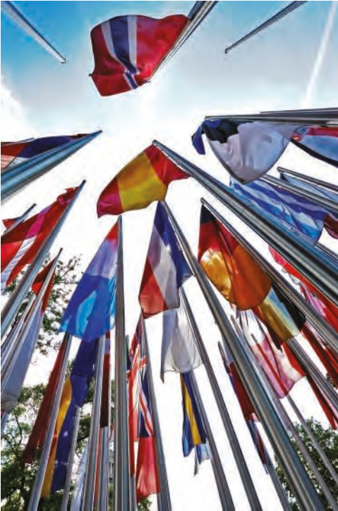
▲ A collection of international flags in Munich, Germany