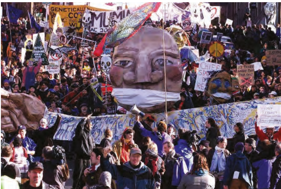
▲ Anti-globalization protests in Seattle, USA