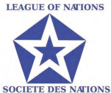
▲ The logo of the League of Nations

The term "United Nations" was coined by Franklin D. Roosevelt in 1942. The United Nations emerged as a pledge by 26 nations to band together and prevent major conflicts, especially with what were called the "Axis Powers", which consisted of Germany, Italy and Japan. They were joined by 24 other countries directly after the Second World War ended, meeting in San Francisco to draft the UN Charter, which was initially signed by 51 countries. The remaining assets of the League of Nations